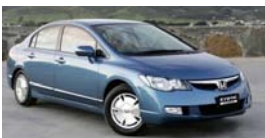
Honda Civic Hybrid